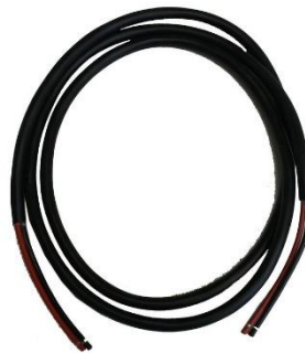
20' Outdoor Rated 12AWG Cable