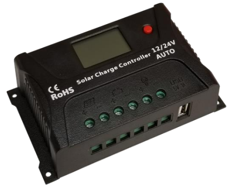
12V / 24V Intelligent Solar Charge Controller